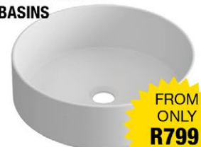
FREE STANDING BASINS